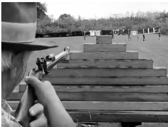
Image shows positioning of rifle for Table Rest match. Fore stock or muzzle of rifle is placed on a step of the pyramid of 2x4s. Butt stock does not touch the table, and is supported only by shooter